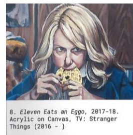
8. Eaten Eats an Egg , 2017-18. Acrylic on Canvas, TV: Stranger Things (2016 - )

How does our consumption of media culture, through film and television, shape our own identity and understanding of the world around us?