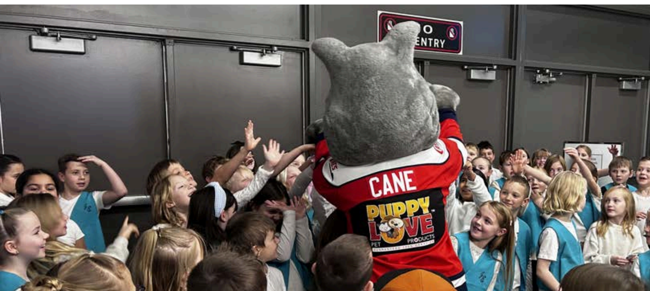
JEES Choir at the Hurricanes Game